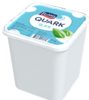
Quark, fat 0,5%