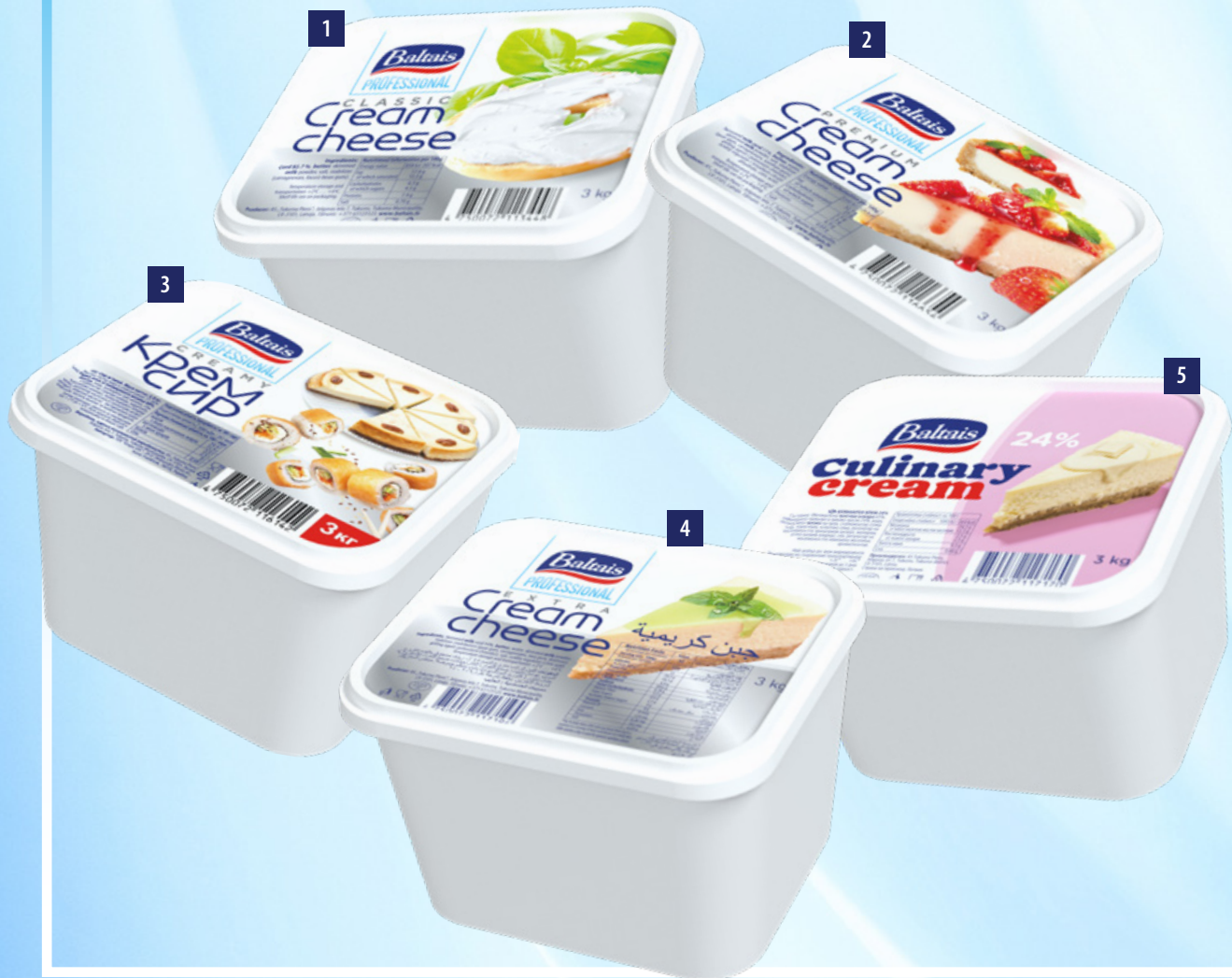
1 Cream cheese classic, fat 17,8% EAN: 4750072113448