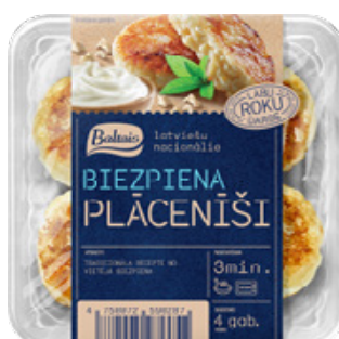
Curd fritters (Sirniki)