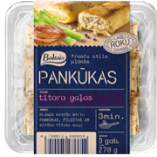
Pancakes with turkey