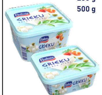
Baltais Greek. White cheese, fat 16,1%