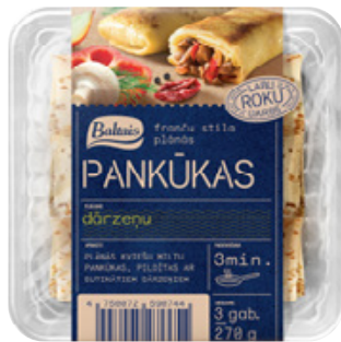
Pancakes with vegetables