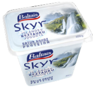
Fat-free SKYR yogurt, fat 0,1%