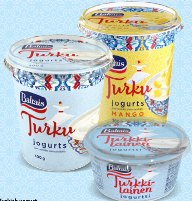
Turkish yogurt without additives, fat 10%