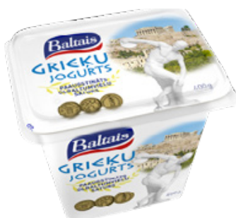
Greek yogurt, protein 9%, fat 2%