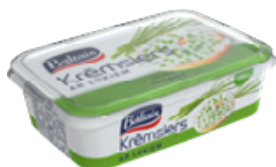
Cream cheese with chives, fat 17,0%