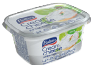
Cream cheese natural, fat 17,8%