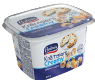
Cream cheese "Creamy", fat 24%