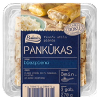
Pancakes with curd