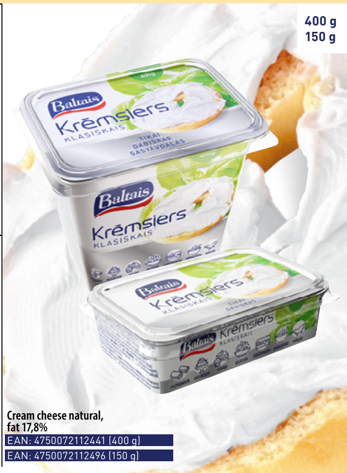
Cream cheese natural, fat 17,8%