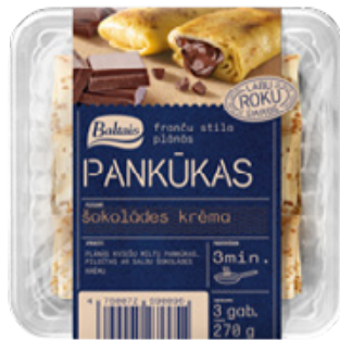
Pancakes with chocolate cream