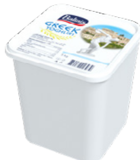
Greek yoghurt. Natural