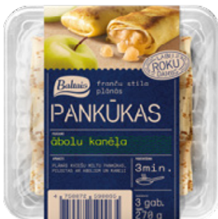
Pancakes with apple and cinnamon