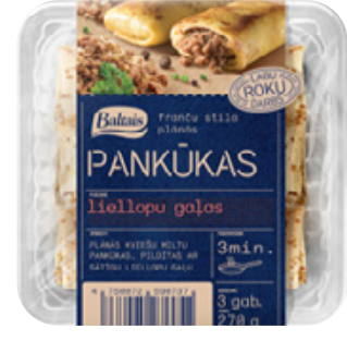
Pancakes with beef