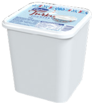
Turkish yogurt without additives, fat 10%