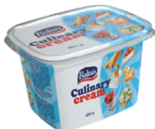
Culinary cream, fat 24%