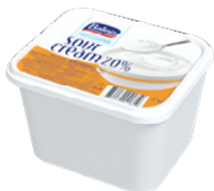
Sour cream, fat 20%