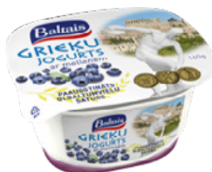
Greek yogurt with bilberries, protein 6,4%, fat 1,6%