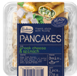
Pancakes with greek cheese and spinach