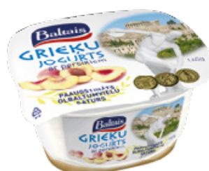
Greek yogurt with peaches, protein 6,4%, fat 1,6%