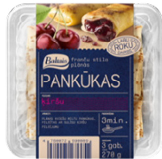
Pancakes with cherry